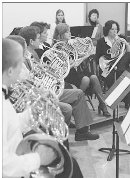
UCA French Horn Choir