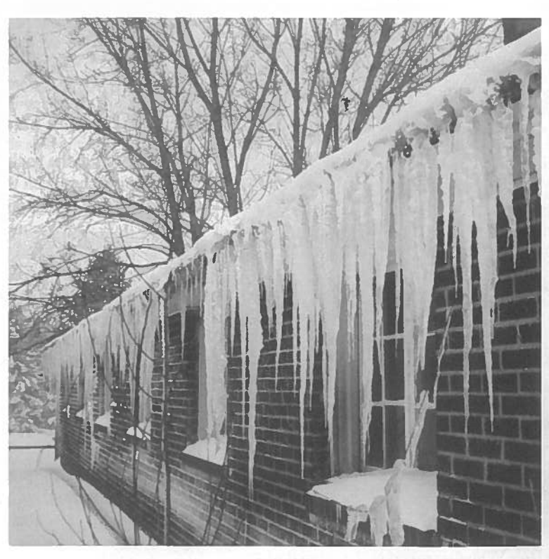
In a few months (five or six) this will all be a memory!