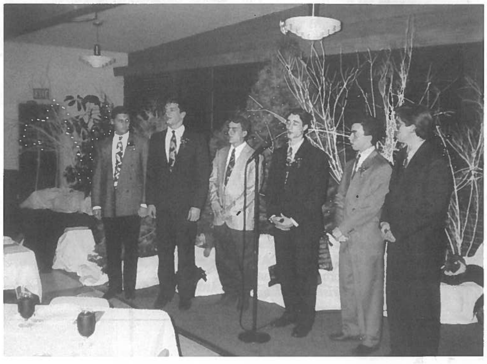
Sigma Kappa Sigma officers stand before the admiring crowd at their banquet!