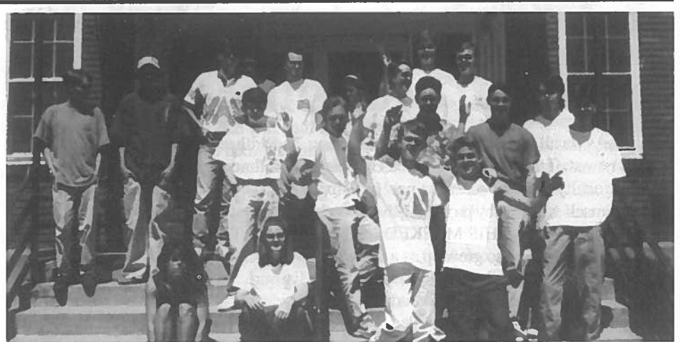
A fuzzy group of seniors (who by strange coincidence also happen to be in journalism class) gathers on the ad. building steps to bid you and UCA good-bye