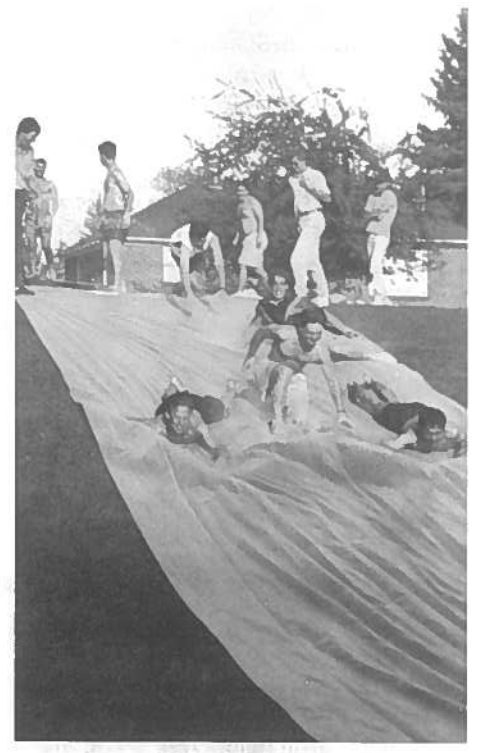
Take a hill, a huge sheet of plastic, a heat wave, and some water, and daring souls can get wet, bruised and battered