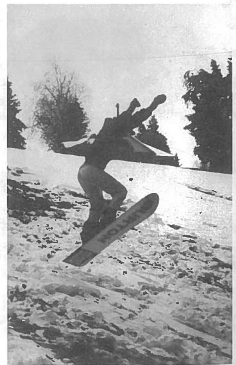
It only takes a little snow to get some folks started. Here a desperate snowboarder tries a run on "Mount Boys' Dorm."