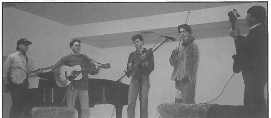
The Bluegrass Band twangs out a "cowboy" version of Deck the Halls.