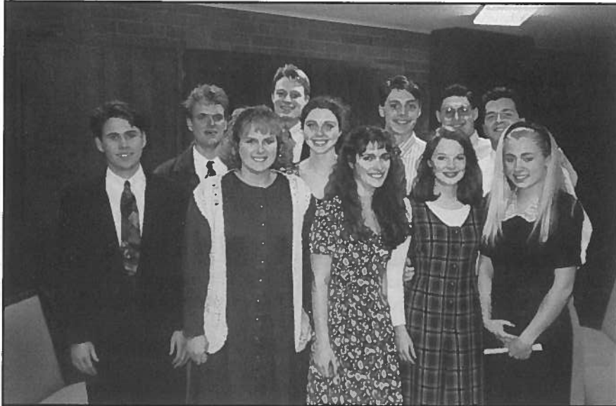
This impressive-looking bunch of smiling people also happens to be our Week of Prayer speakers. Great job, guys!