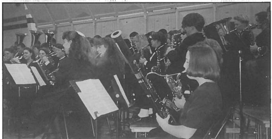
Band members concentrate on perfection during another Holiday arrangement

March 7-12 - Week of Prayer 15-27 - Spring Break