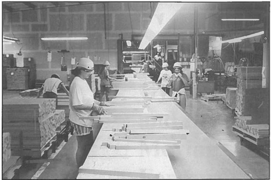
Thunderbird employees keep very busy on a typical work day.