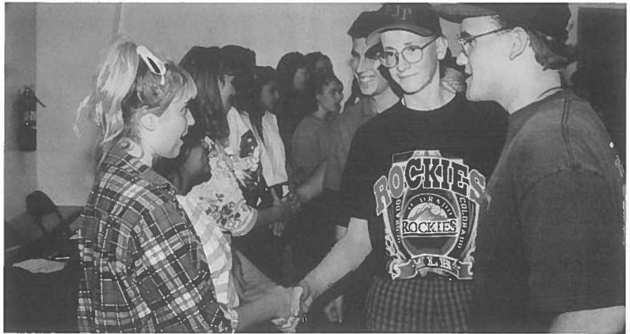
New and returning students put their best hands forward on Registration Night.