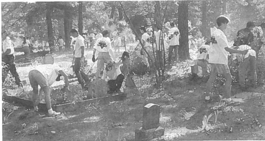
Students work diligently at Pioneer Graveyard, determined to make the place look better.

"I can do all things through Christ who strengthens me." Philippians 4:13