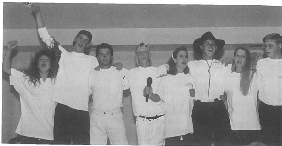
First-semester ASB officers cheer in another year at UCA. Their message: get all you can from school.