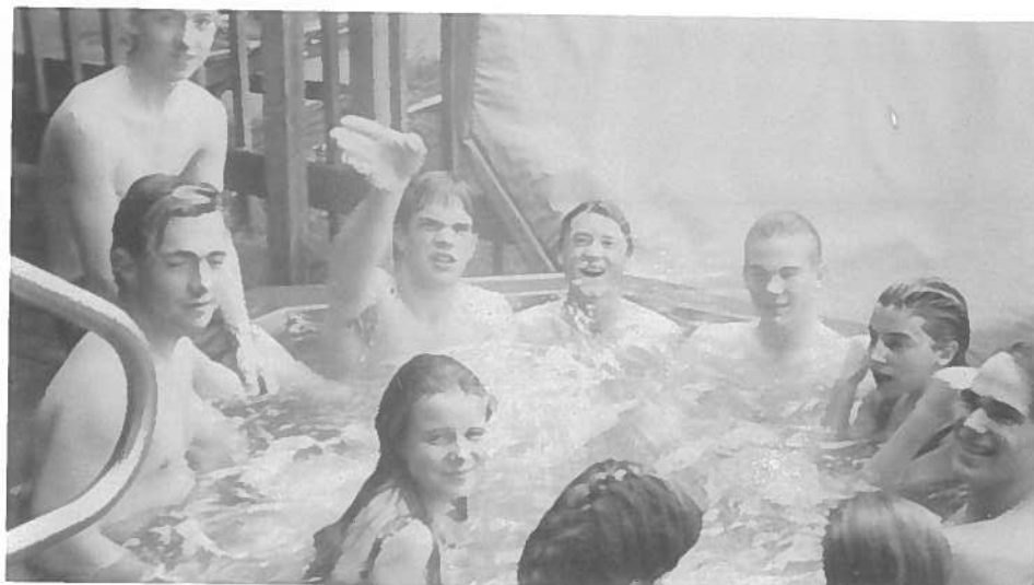
Bravely, this small group of people smiles for the camera. They've sacrificed indoor comforts to sit in the hot tub.