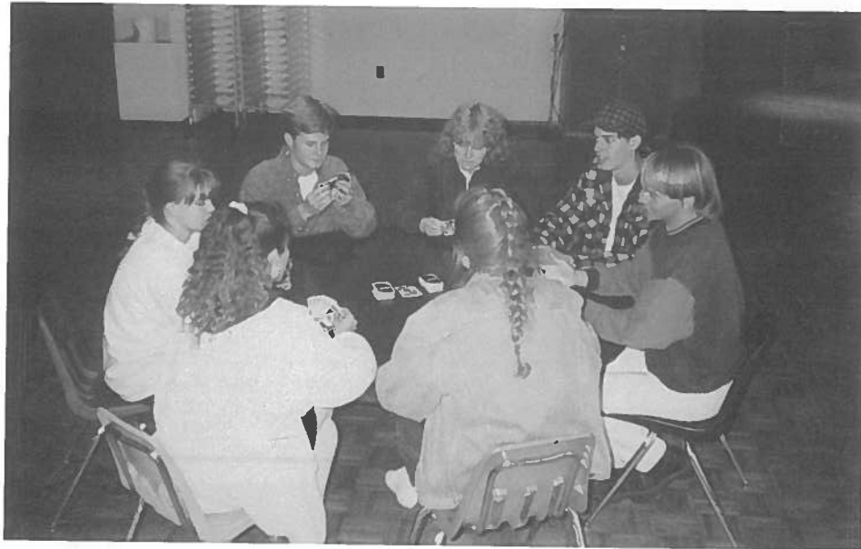
A strenuous game of UNO is enough exercise for some.