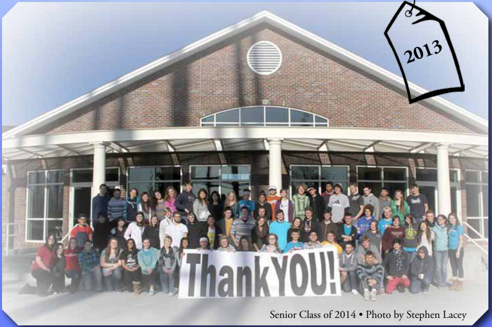
Senior Class of 2014