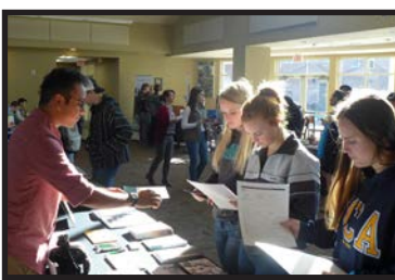
Representatives from eight Adventist colleges came to share information at the annual College Fair.