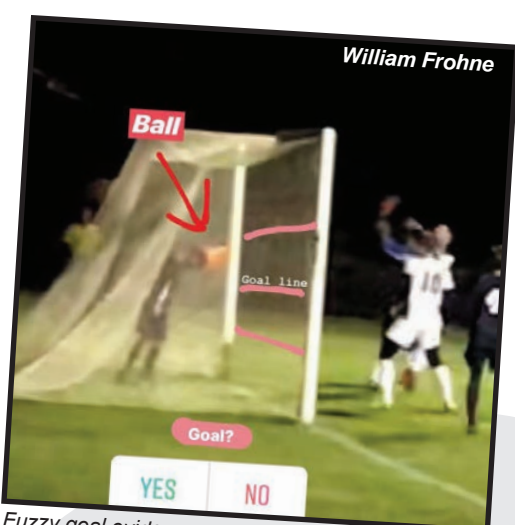
Fuzzy goal evidence captured from a video