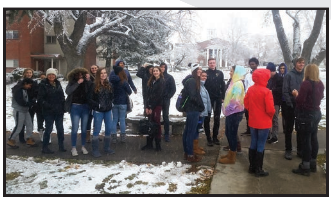
After the first snow on November 9, students wait for a Sabbath afternoon ride to Manito Park