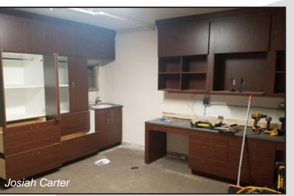
Top: the tile saw in a hallway Bottom: a nearly-finished room