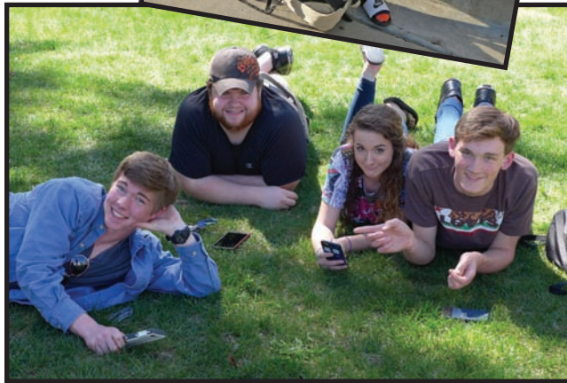
Spring: a time to sit on the ad building steps and lounge on the lawns . . . cell phones close at hand